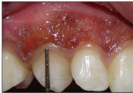
Fig 4: Crown Lengthening

gingival sulcus was retained to avoid inflammation of the tissue and impingement of biologic width. The diode laser was used in contact for these procedures, and as such should be used with an initiated tip. Proper initiation of the tip uses articulating paper at 0.5 continuous wave for 5-8 seconds painting both the tip and the sides of the disposable single use tip. The procedure was performed using the picasso single use disposable tips (Figure 4).