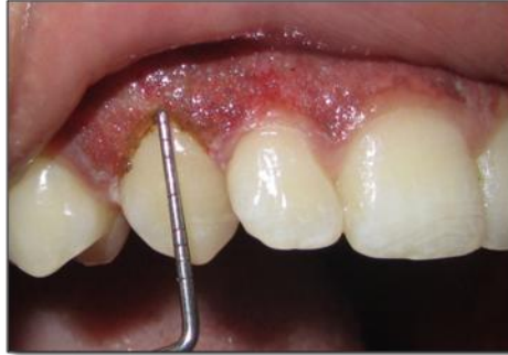
Fig 6: Immediate Post-Operative View

depigmentation procedures were completed at low settings of around 0.6-1.5 watts continuous wave (CW) with an initiated tip. A follow-up was done at the end of 1 day. The patient was completely asymptomatic postoperatively (Figure 6-9).