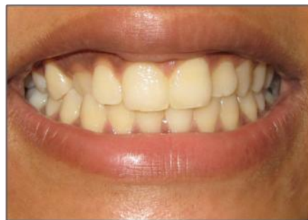
Fig 2: Pre-Operative Smile

was completed using diode laser at the same appointment. A 23-year old female patient reported to Department of Periodontology, Manipal College of Dental Sciences, Manipal with the demand for cosmetic correction of “Black Gums” and uneven smile line. (Figures 2, 3). After oral prophylaxis the patient was recalled after 7 days for the gingivectomy and depigmentation procedure.