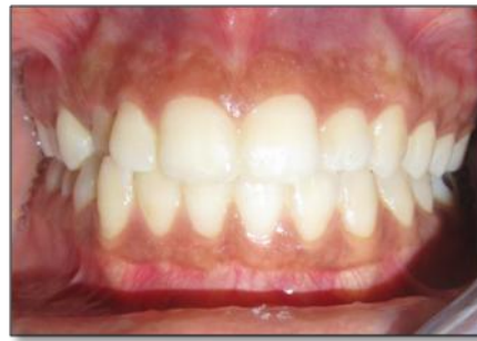
Fig 9: Post – Operative After 6 Months