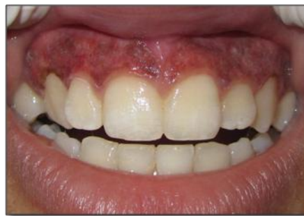
Fig 7: Immediate Post - Operative View after Gingivectomy and Depigmentation