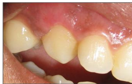
Fig 8: Post - Operative View 1month