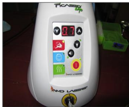
Figure 5: Diode Laser

The genotype of the tissue is important to consider when determining settings that should be used. The thinner the tissue, the more likely recession can occur