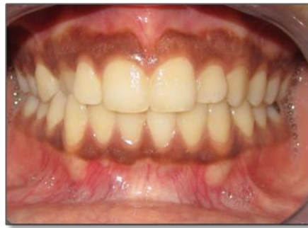
Fig 3: Pre-Operative Frontal View