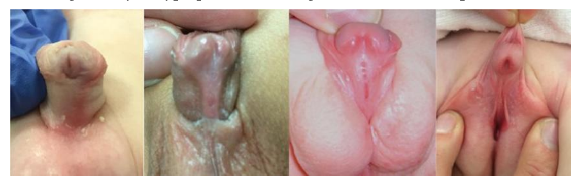
Figure 2. Increasing severity of hypospadias (left to right): distal, midshaft, penoscrotal, and perineal7

Patients may have a hooded foreskin, which is defined as abundant foreskin in the dorsal side of the penis and nonexistent or sparse foreskin in the ventral surface of the penis, regardless of where the meatus is located.<sup>7</sup>